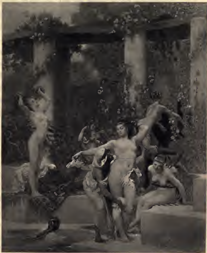
The Garden of the Gods, by the sculptor, Giovanni Stanetti. The figures are the gods of the Roman pantheon, and the scene is set in the garden of the gods, where they are often depicted in a state of revelry and excess. The sculpture is a masterpiece of classical art, and it is a fine example of the work of the sculptor, Giovanni Stanetti.